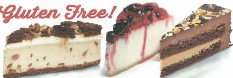
TURTLE CHEESECAKE • VERY BERRY CHEESECAKE • CHOCOLATE ALMOND TORTE